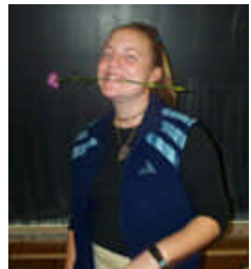
Apprentice w/ Carnation