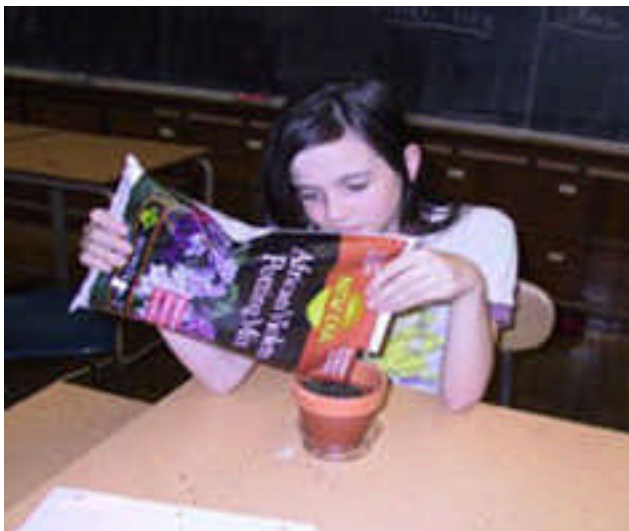
Adds soil to the pot

Cost: A plant costs approximately $3.00 - $7.00, depending on the size.