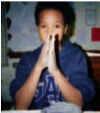
First, roll a coil

What didn't work: Making a pot with holes in the walls, making the walls too thin, making the bottom too wide, and making the walls of different thickness. Once the pot is dry, you cannot add clay, it will not stick.