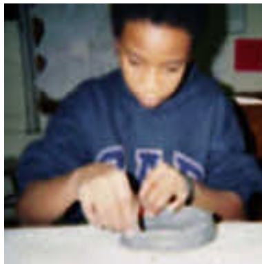
Then stack them up