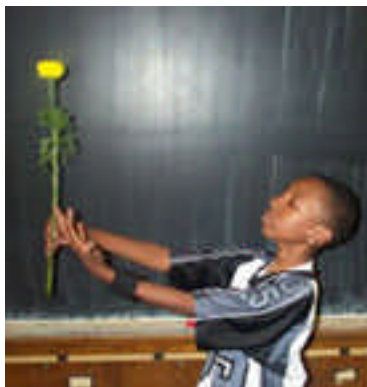
Apprentice with Marigold