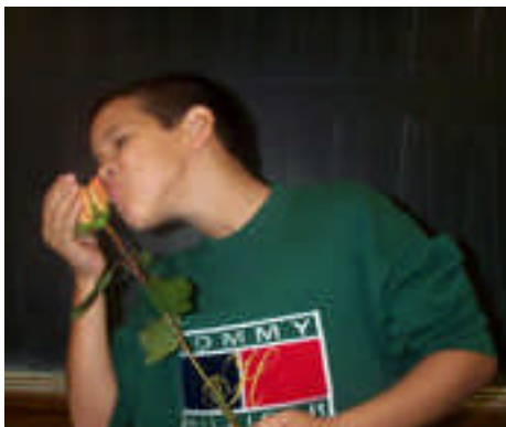
Apprentice with a Rose

Our favorite flowers are roses, carnations, marigolds, and tulips: