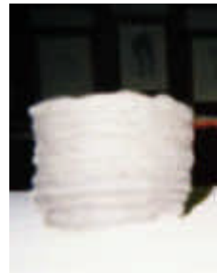
Finally, a finished pot!