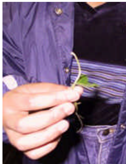
An ivy clipping